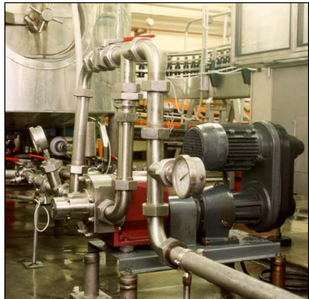
Series S pump in a major brewery