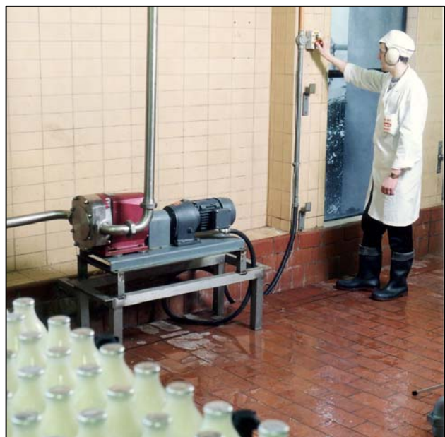
Series S pump on milk processing